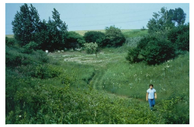
A rehabilitated pit in the University of Guelph Arboretum provides research opportunities for students (Bronze Plaque, 1996).

These rehabilitated pits and quarries provide opportunities for wildlife habitat, passive recreation, geological interpretation, botanical research and showcase important cultural heritage features.