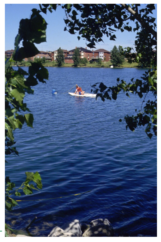
A popular water sports facility, Professor's Lake, Brampton, is a rehabilitated pit and a recipient of the Bronze Plaque Award (1989).

These sites combine residential and recreational uses. Smythe Park, for example, was once a gravel pit and now features a marshy environment for wildlife habitat, and facilities for swimming, baseball, and tennis.