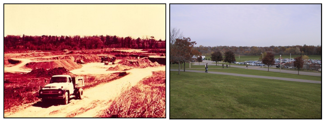
Extraction at the future site of Erindale College (U of T) in Mississauga (Circa: 1955).

The Don Valley Brick Works Park received a Bronze Plaque in 2000 to commemorate the origins of this site as a quarry and its transformation into an outstanding natural environment and cultural heritage park for the citizens of the Greater Toronto Region. The quarry face in the background is considered an internationally significant geologic site by geologists around the world.