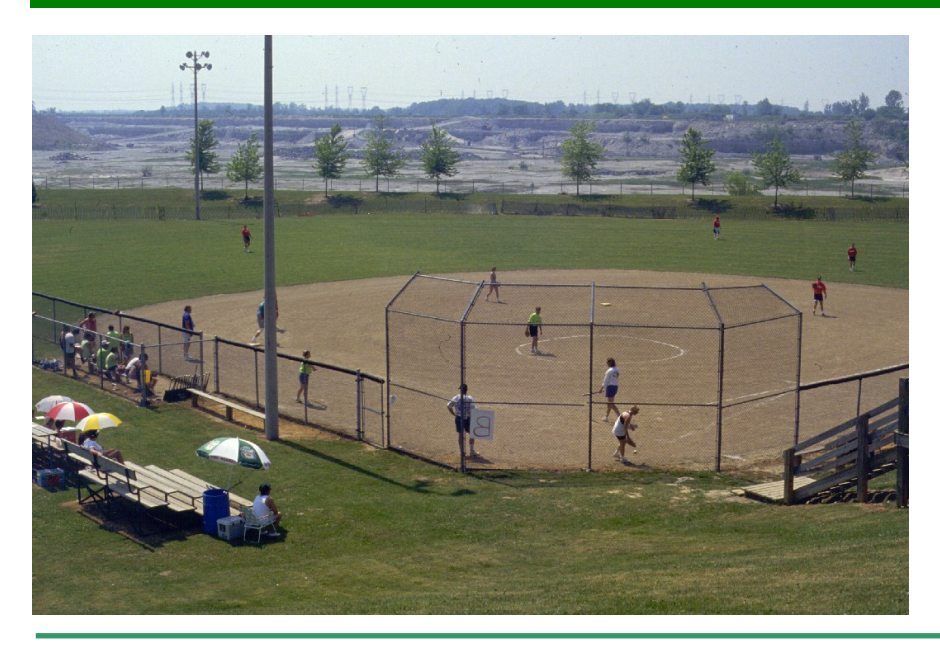
Hagersville Ball Park in Hagersville, Ontario, is a Bronze Plaque winner (1994). This recreational facility is a good example of a rehabilitated site adjacent to a working site where aggregate extraction continues. A working pit is in the background of this site.