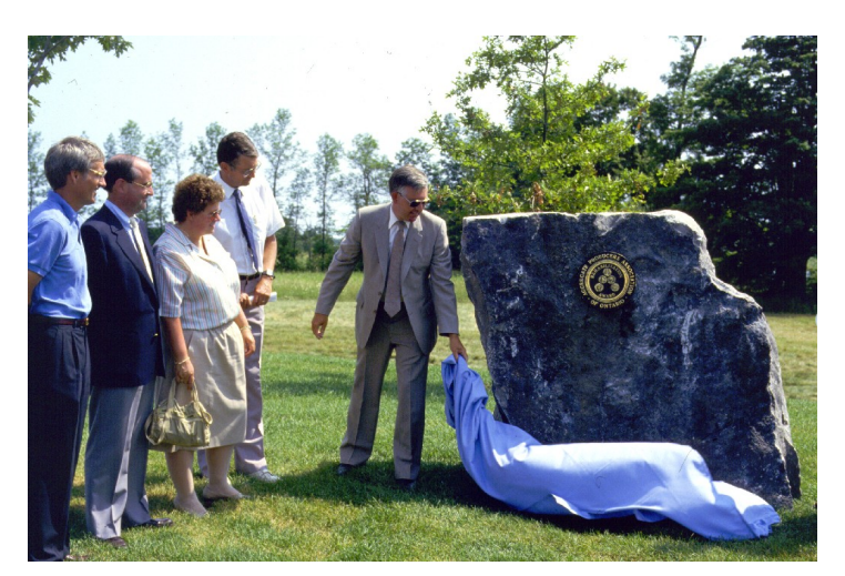
The Bronze Plaque (1987) is unveiled at Lakeland Estates, a recreational and residential development, following aggregate extraction in the Ottawa area.