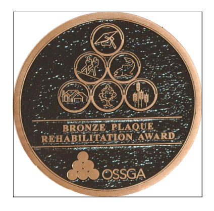
The Ontario Stone, Sand & Gravel Association's Bronze Plaque award

Bronze Plaque Award winning sites demonstrate: