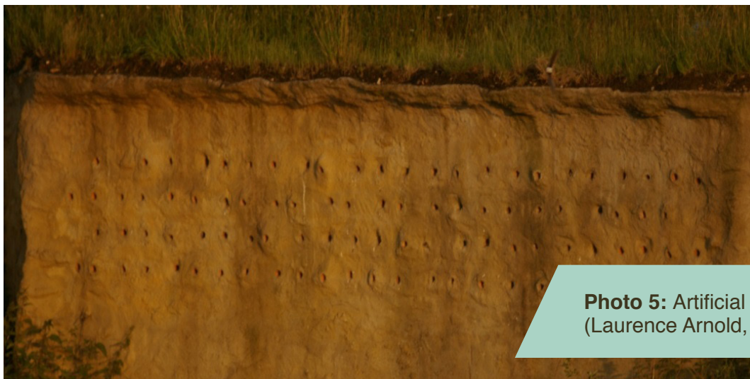
Photo 5: Artificial nest wall

Other creative solutions for providing nesting structures can be explored, as long as they adhere to the general recommendations outlined above. For example, large barrels with holes bored into them and erected on posts have proven to be attractive to Bank Swallows (Sand Martins) at a site in Scotland (Hopkins 2001).