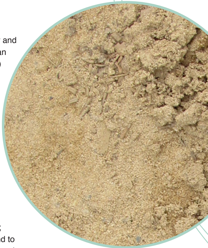
Photograph of sand as an example of substrate

It is important for banks to be as close to vertical as possible and the smoother the better to limit access by terrestrial predators (LBV 2013; Heidelberg Sand und Kies, no date); unstable and slumping faces tend to not be used (Cadman and Browning 2012). Avoid overhanging faces as they are more likely to collapse (Cadman pers. comm. 2016).