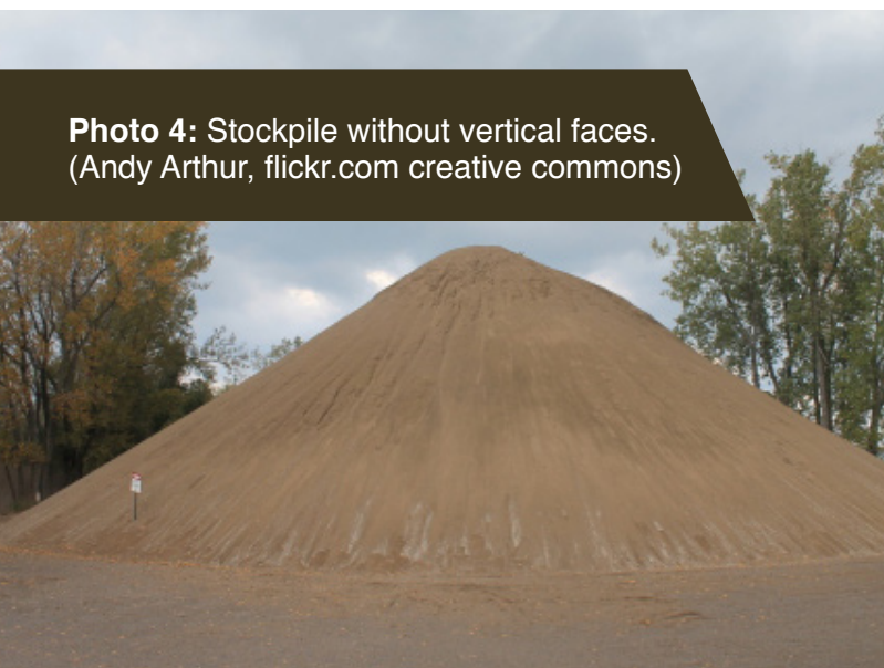
Photo 4: Stockpile without vertical faces.

Note that any slopes or parts of slopes that are not rendered unsuitable can be occupied as quickly as overnight.