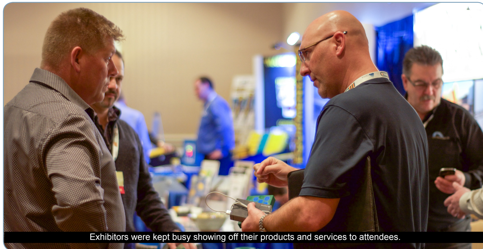
Exhibitors were kept busy showing off their products and services to attendees.