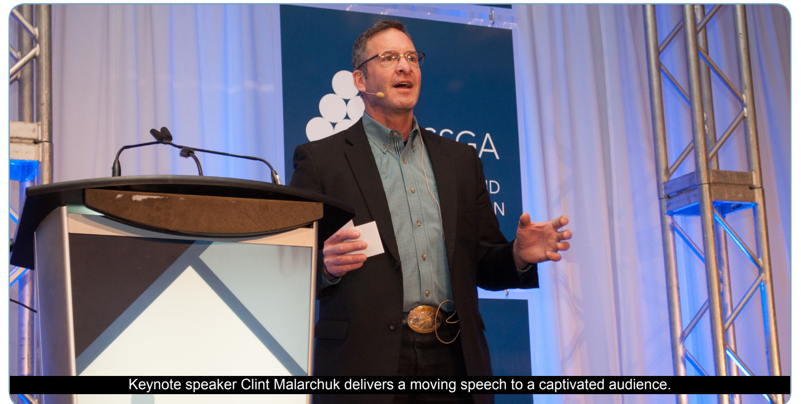
Keynote speaker Clint Malarchuk delivers a moving speech to a captivated audience.